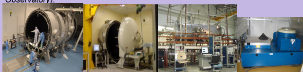
Thermal vacuum and other test facilities. Test equipments at ERIOS (Lab. d'Astrophysique Marseille) and SERMS (Univ. of Perugia).